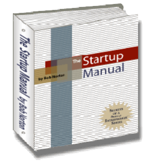
The Startup Manual ALL FOURS BOOKS + Biz Design Tools CD