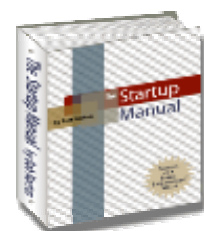
ALL FOURS BOOKS

The Startup Manual includes all four books plus our proprietary business design tools CD-ROM.